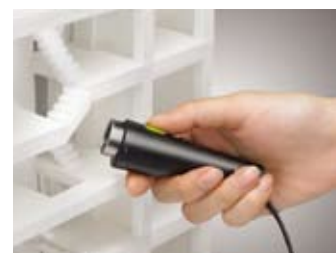
Close up mode with adjustable macro focus

IPEVO creates Internet devices that expand and enhance the overall Experience over the Internet. Renowned for its iconic line of best-selling VoIP and Skype hardware, IPEVO has established a reputation for innovating award-winning designs and affordable products to help make the Internet a better place for what matters most - connecting, communicating, and sharing with the world around us.