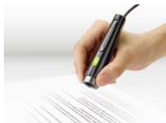
Point and Capture