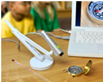
EFFECTIVE TEACHING AID