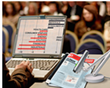
LARGE SCALE PRESENTATIONS