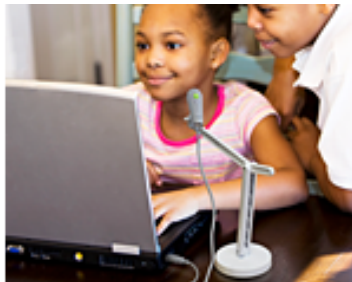
WEB CHATS AND WEBCASTS